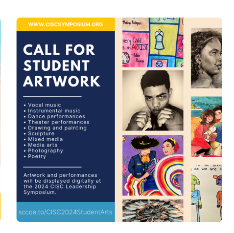
Call for Presenters!