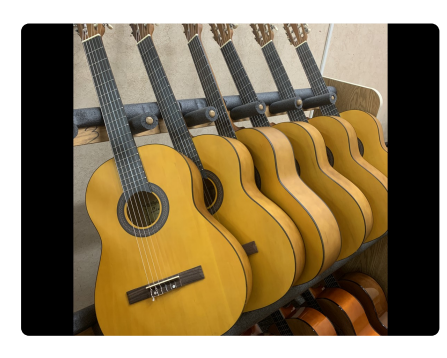
Arts Materials and Supplies